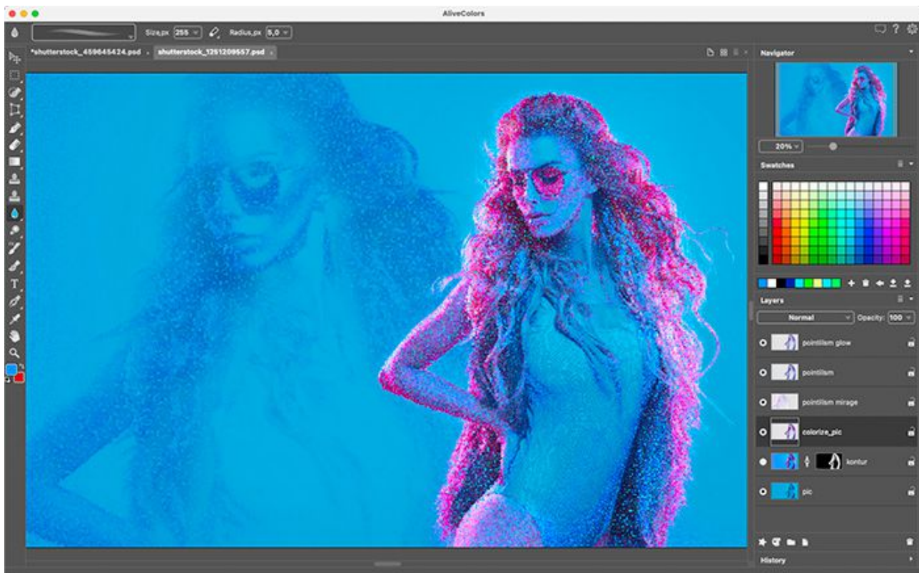
Figure 1. This is AliveColors workspace. There are tools that line the edges of the window - many of which should be familiar to digital artists.

Along the right side of the AliveColors window are the familiar: Layers, History, Navigator, Color, Actions, Channels, etc. panels/tabs. Here is an in-depth explanation for a couple of the Panels: