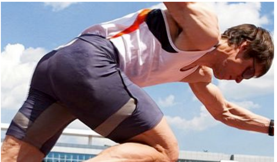
Figure 2. The new AI Motion Blur filter easily removes the blur (top photo), which leaves you with nice sharp images (bottom photo).