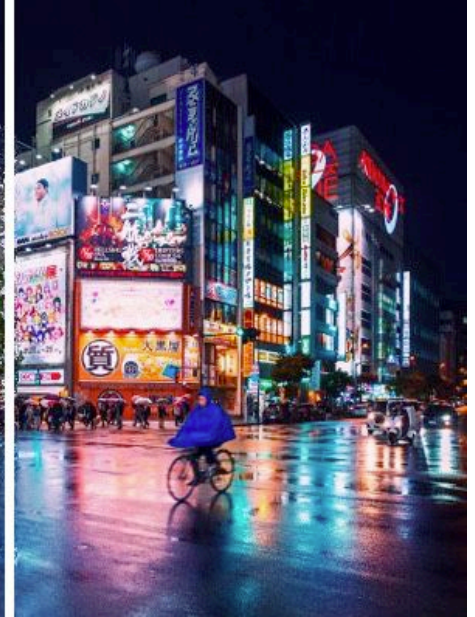
Figure 6. The Splatter effect modifies the look of your photo using splatters, splashes, and blots of paint. This makes it look like you are looking through a rainy windshield.