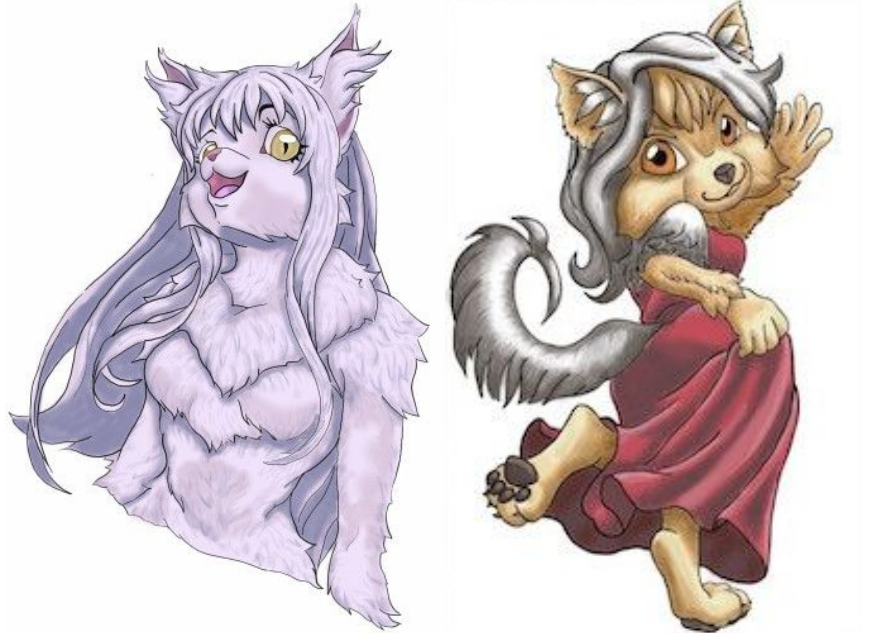
Figure 8. In addition to being a photo editor, AliveColors is also a full art program. These are two cartoons that I drew (a little while ago). AliveColors also has tools to create Oil paintings, Pencil drawings, etc.