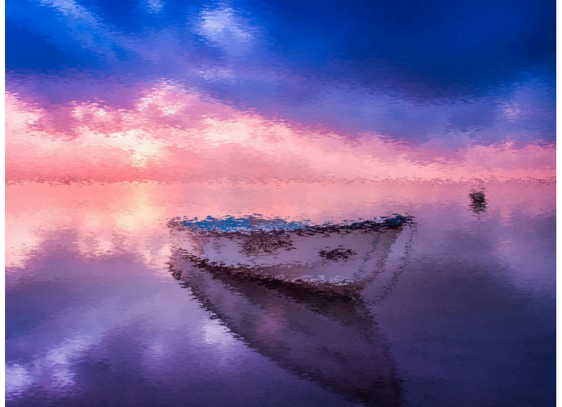
Figure 5. This simulates paint spraying along the specified direction.